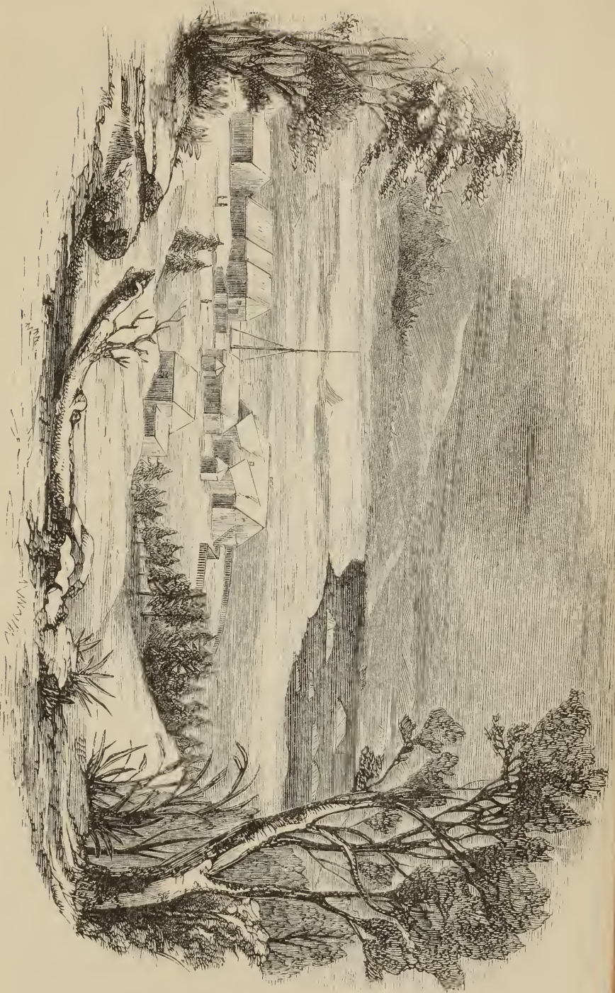
VIEW OF TADOUSSAC. Page 214.